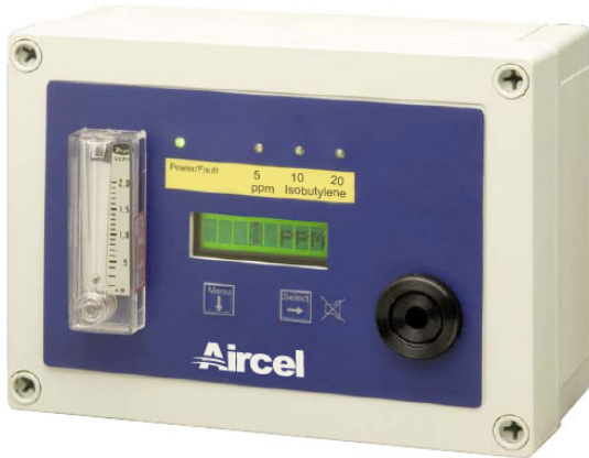
AMD-300 VOC Monitor