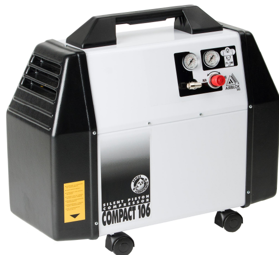
- INTEGRATED OIL FREE AIR COMPRESSOR PACKAGE

FROM THE ANALYSIS OF THE APPLICATION TO THE TREATMENT OF THE AIR, WERATHER INC. IS IN A POSITION TO SUPPLY THE MOST SUITABLE COMPRESSOR AND CORRESPONDING ACCESSORIES FOR THE CUSTOMER'S NEEDS.