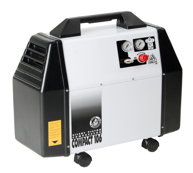
- INTEGRATED OIL FREE AIR COMPRESSOR PACKAGE

FROM THE ANALYSIS OF THE APPLICATION TO THE TREATMENT OF THE AIR, WERTHER INC. IS IN A POSITION TO SUPPLY THE MOST SUITABLE COMPRESSOR AND CORRESPONDING ACCESSORIES FOR THE CUSTOMER'S NEEDS.